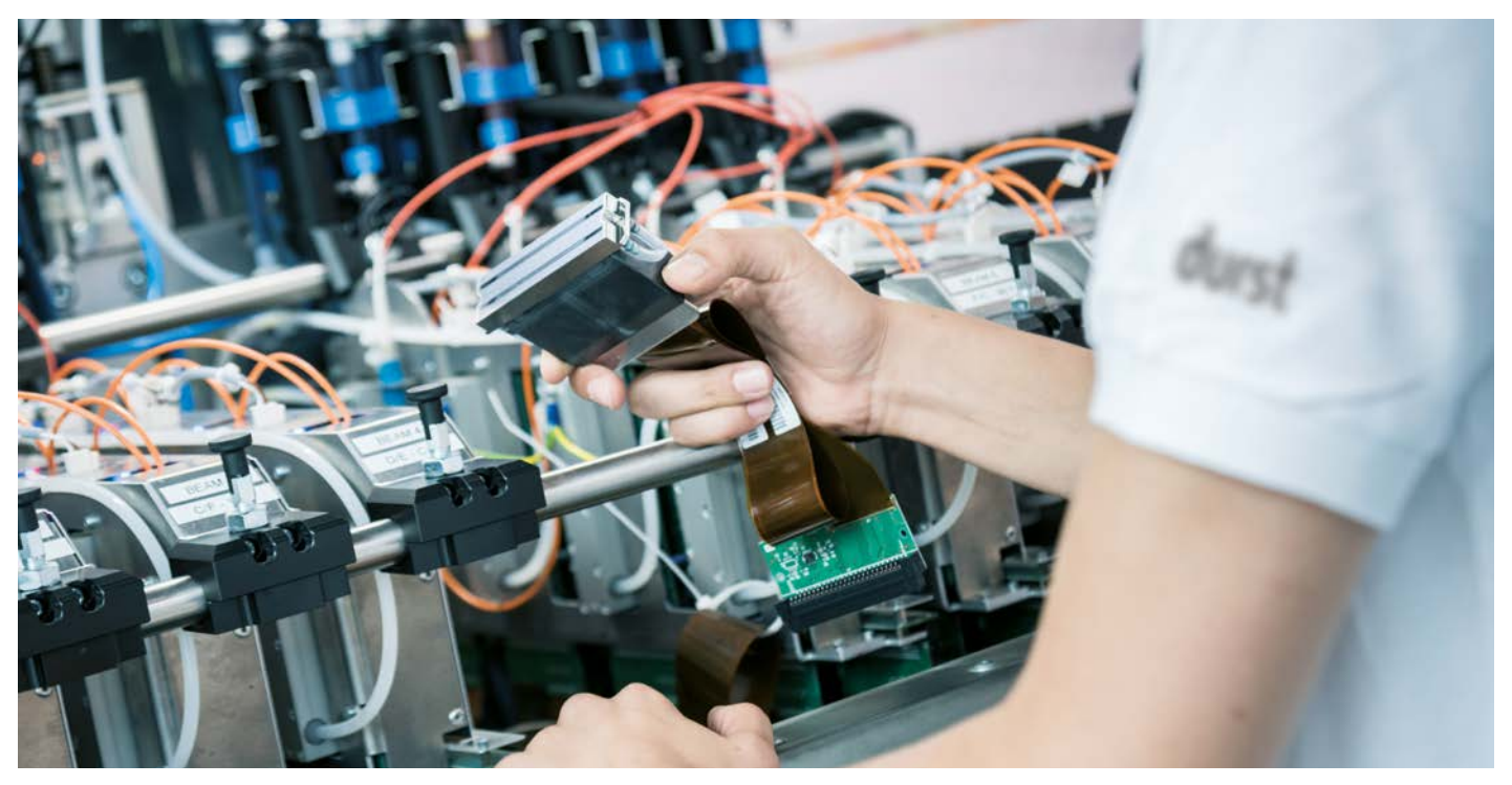
Simple Exchange of Printheads

When necessary, the new generation of Durst WTS printheads can be exchanged by the operator in very short time, minimizing downtime.