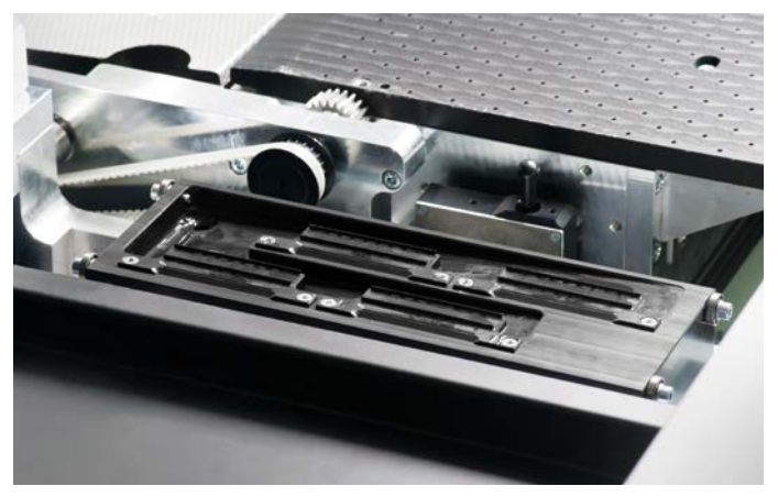
Automated Purging and Head Cleaning Station Thanks to an automated purge system, the printhead cleaning operations are minimized, ensuring continuous operation of the printer, with an extremely reduced maintenance time.

The new Durst WTS printhead technology achieves an exceptionally high quality print using water based dye sub inks for different applications for direct and transfer paper printing, and reaches high printing speed for higher productions.