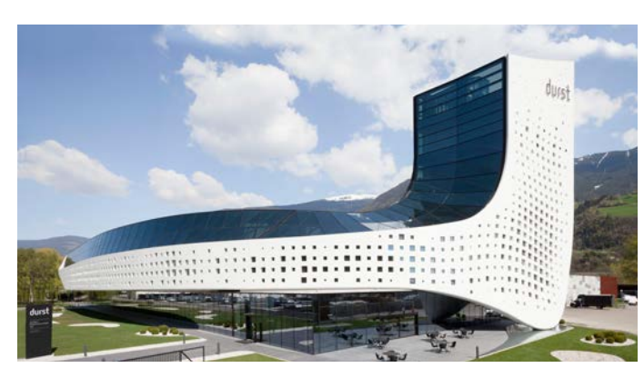
Durst location in Brixen, Italy