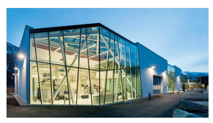
Durst location in Lienz, Austria