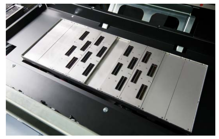
Air-sealed Capping Station The hermetically sealed printhead capping station fully encloses the nozzles and thus guarantees the immediate availability of the printer even after long inactive periods.